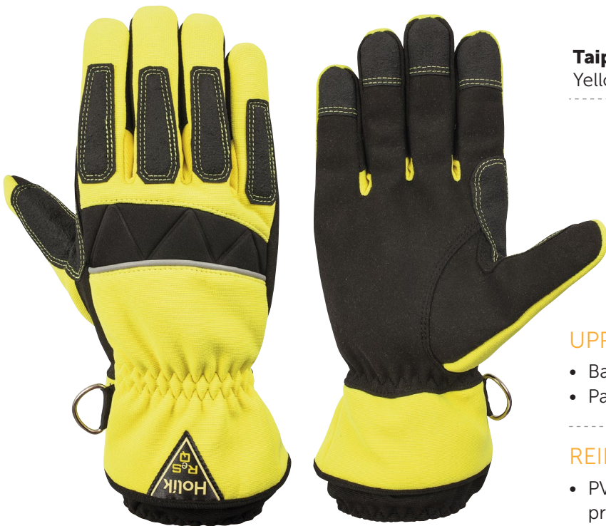
Taipa 6508 Yellow

Protect hands of the firefighters – rescuers during their work in technical situations as well as in the most demanding conditions. They provide the highest levels of protection according to the standard EN 388 and simultaneously the maximum possible flexibility and sensitivity.