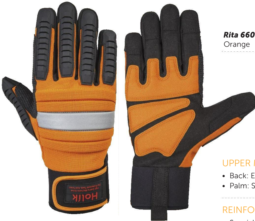
Rita 6604 Orange

Protective gloves ideal for work in forest environments. The high sensitivity and impact protection of the knuckles on the back of the hand make them suitable for working with saws.