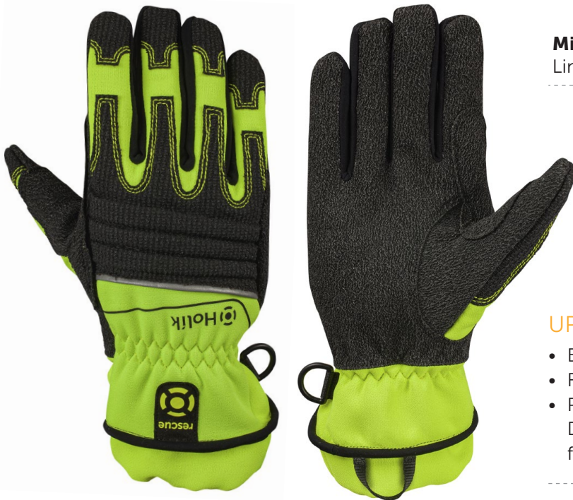
Miwa 6507 Lime green

Protective gloves for rescue work by the fire brigade. Higher resistance not only on the back and palm of the hand, but also between the middle fingers.