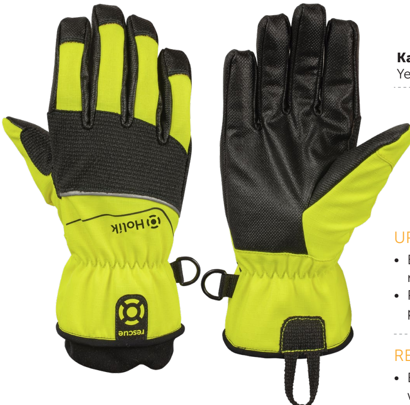
Kashi 8275 Yellow

Protective gloves with higher resistance to mechanical damage on the palm, back of the hand and between finger.