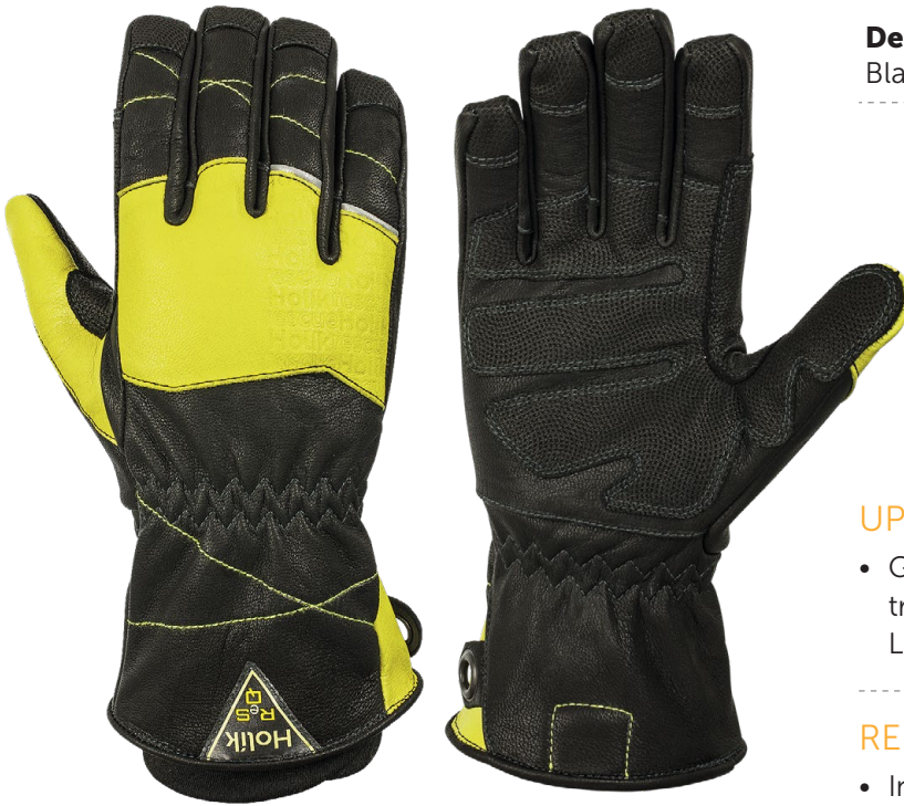
Deborah I 8268 Black / bitter lemon

Unique model for the use of highly visible leather. The construction of the glove has undergone a long development and brings high sensitivity and comfortable handling of objects.