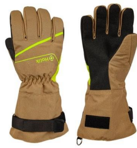
Maris Long Beige