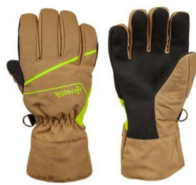
Maris Easy Beige