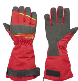
Diamond Long Red