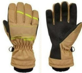
Diamond Evo Beige