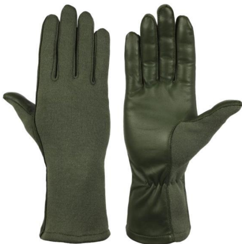
Tracy Sage Green