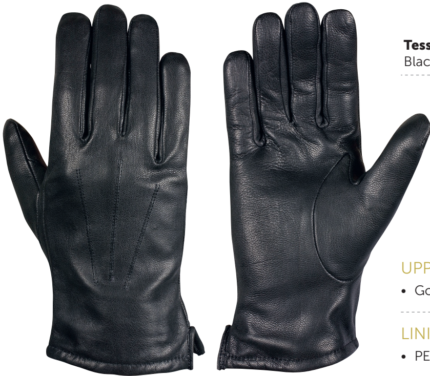
Tessa 8435 Black

Gloves intended to be worn during the normal course of business or uniforms for ceremonial occasions