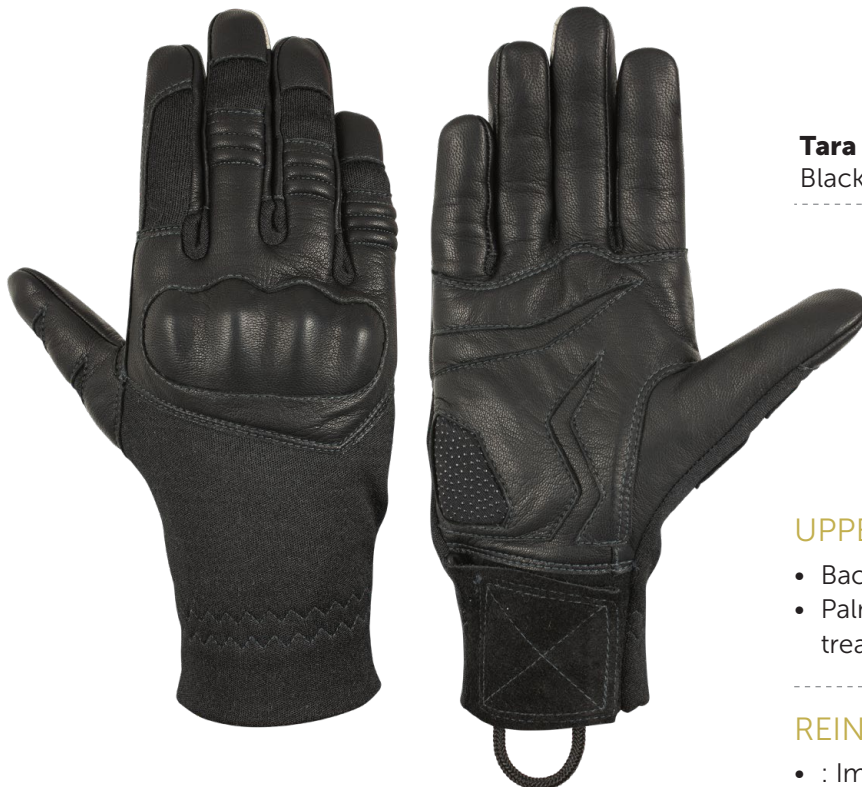
Tara 8517 Black

Textile non-flammable anti-impact glove with exceptional protection of the back joints, ensuring exceptional sensitivity in the interventions of police and military units during interventions during demonstrations, against rowdies, or to prevent conflicts.