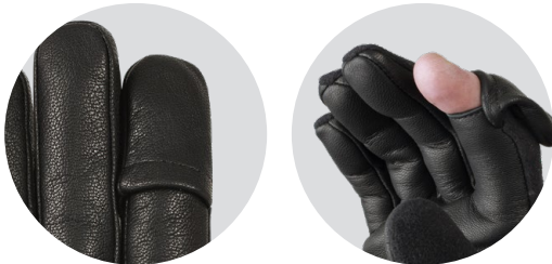
Talia Police Open