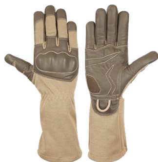
INDIA Coyote Long