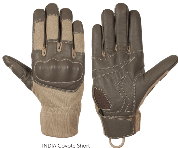
INDIA Coyote Short

Lightweight tactical glove with comfortable joint protection designed not only for special units, but also for routine military and police operations, meeting high demands on resistance to mechanical risks.