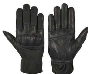
INDIA Black Quick