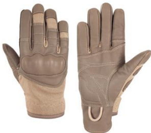
DALIE Coyote Quick