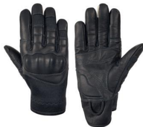
DALIE Black Quick