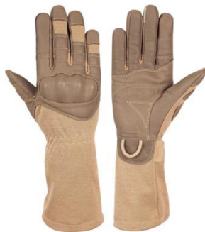
DALIE Coyote Long