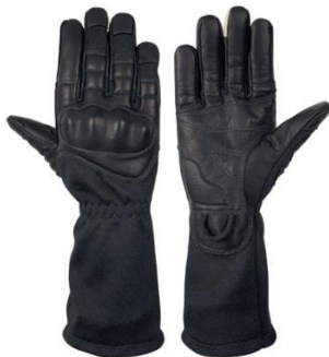
DALIE Black Long