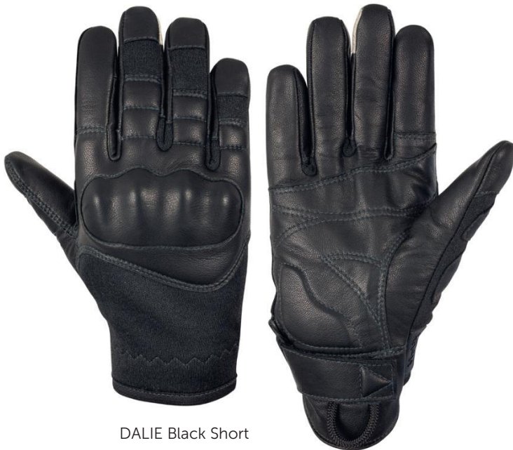
DALIE Black Short

Tactical gloves of anatomical cut with a special shooting finger, at the same time meeting high demands on resistance to mechanical risks.