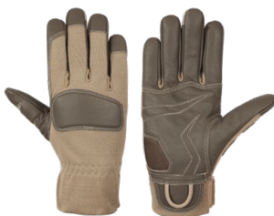
ANIKA Coyote Quick