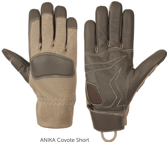
ANIKA Coyote Short

Lightweight tactical glove for all military and police units that meets the demanding requirements for sensitivity in everyday use and at the same time meets high demands for resistance to mechanical risks.