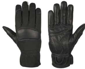
ANIKA Black Quick