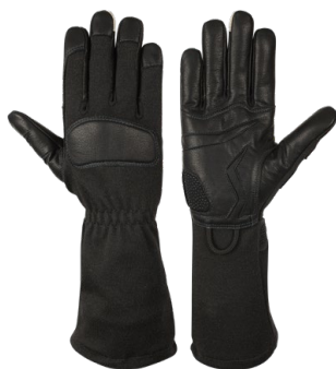
ANIKA Black Long