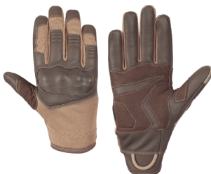
Anat Quick Coyote