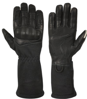
Anat Long Black