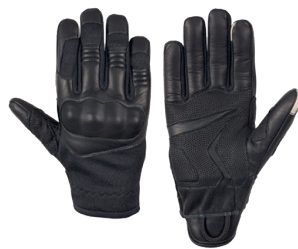
Anat Quick Black