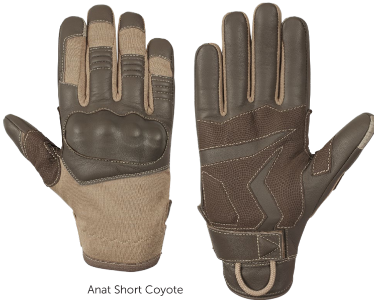
Anat Short Coyote

Tactical glove with an exceptional anatomical comfortable cut, at the same time meeting high demands on resistance to mechanical risks.