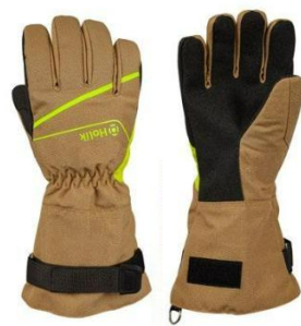
Maris Long Beige