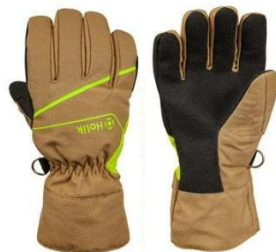
Maris Easy Beige