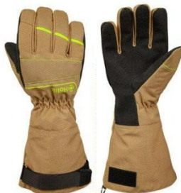
Diamond Lond Beige