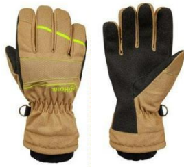
Diamond Evo Beige