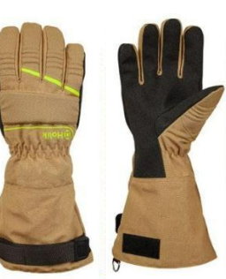
Crystal Long Beige